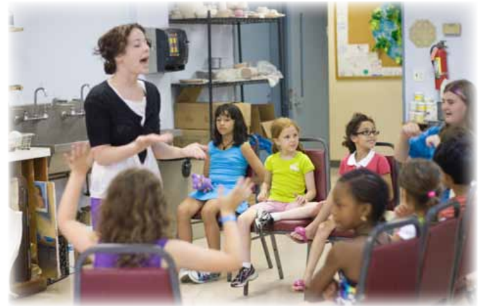
Class of improv being taught

For more information visit us at Riverdalerisingstars.com