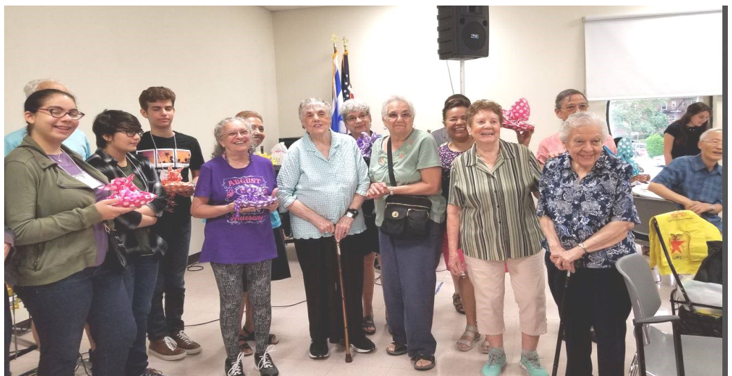
August Birthday Party